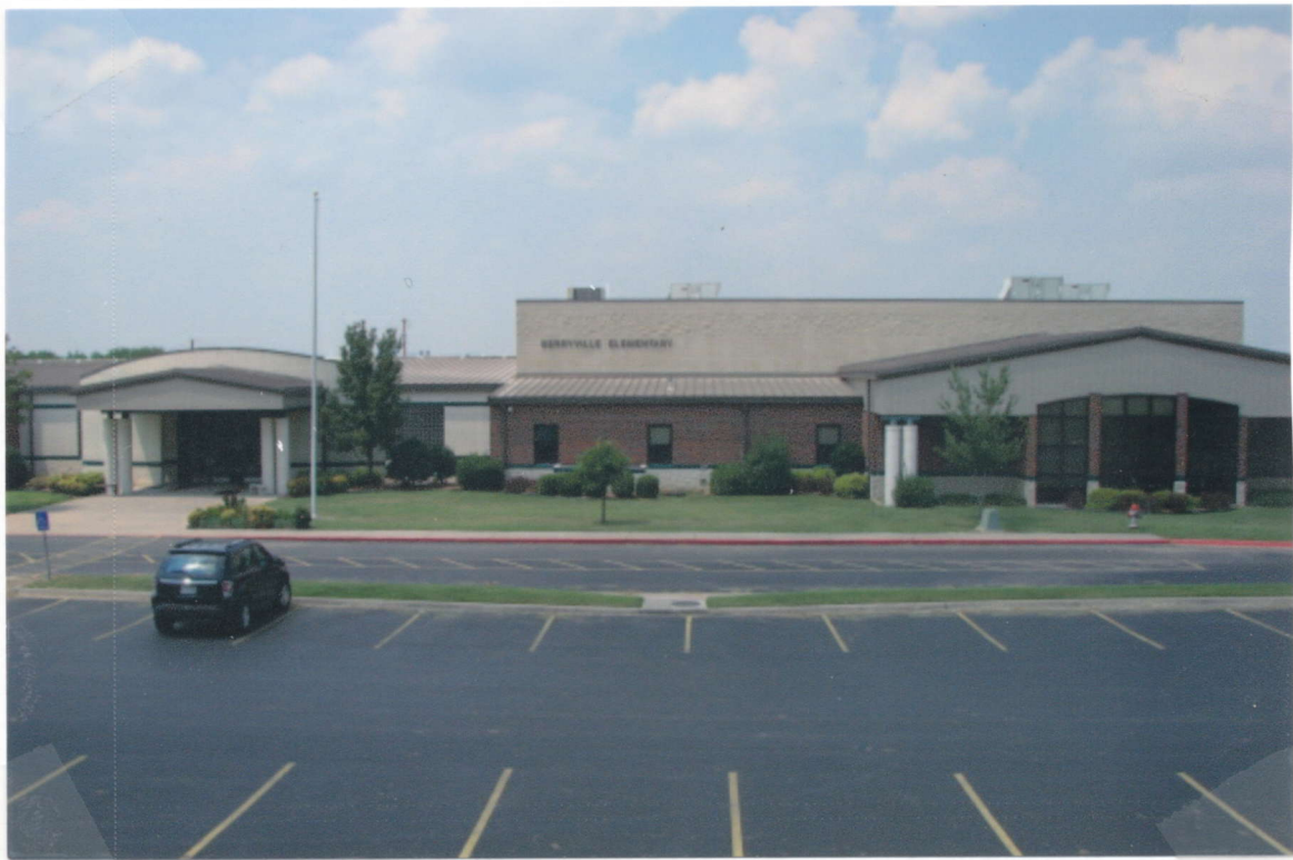
Berryville K-3 School Project