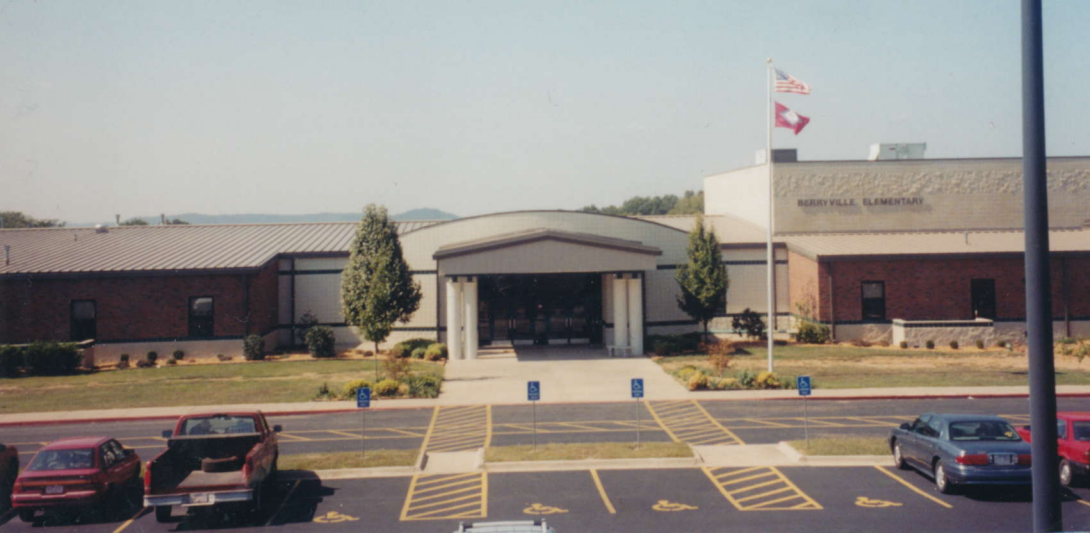
Berryville Elementary School 2003